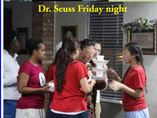
Dr. Seuss Friday night