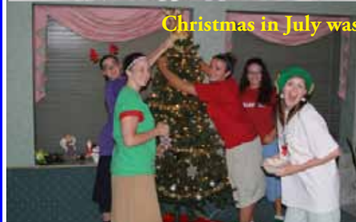
Christmas in July was a big hit with the girls