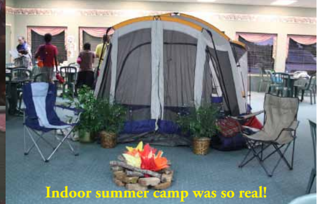
Indoor summer camp was so real!