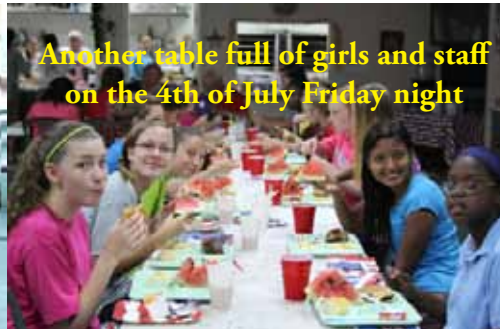
Another table full of girls and staff on the 4th of July Friday night