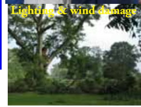
Lightning & wind damage