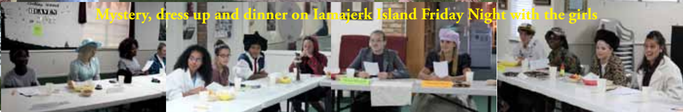
Mystery, dress up and dinner on Lamajerk Island Friday Night with the girls