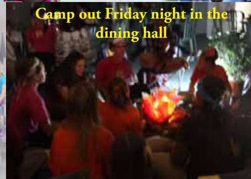
Camp out Friday night in the dining hall