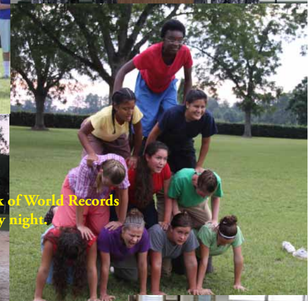
Lighthouse Book of World Records Friday night.