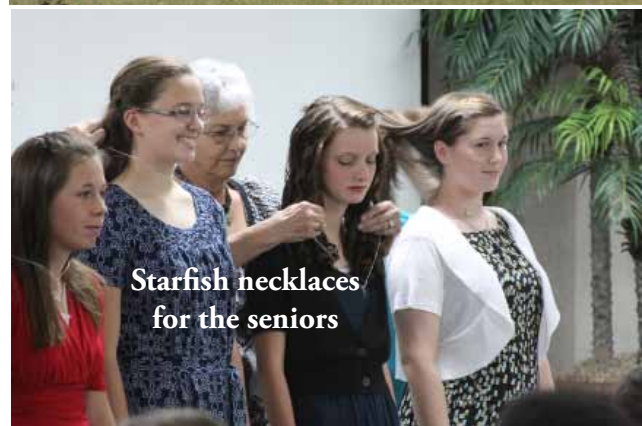
Starfish necklaces for the seniors