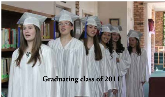
Graduating class of 2011