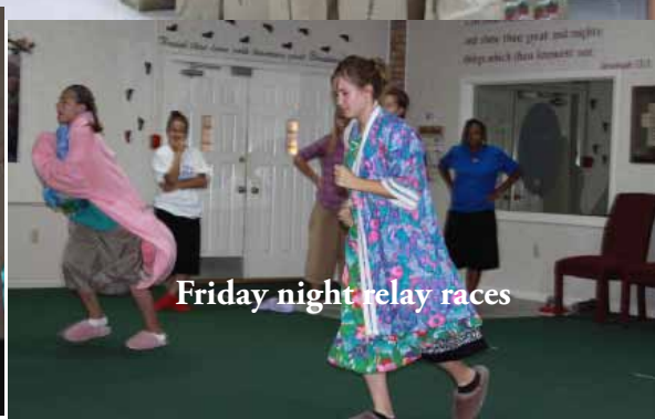
Friday night relay races