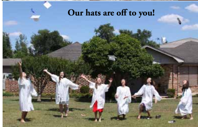
Our hats are off to you!