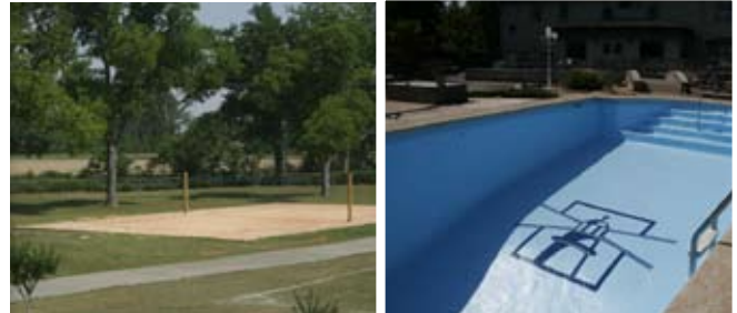
Two noteworthy improvements done to the school facilities are the new sand volleyball court and the re-finished pool complete with the school logo.

to run a concession stand. Several of the staff and students enjoyed the opportunity of serving the community and witnessing.